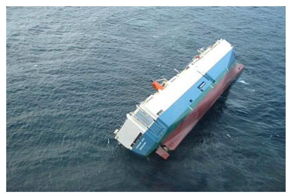
Figure 3: M/V Cougar Ace

During a transfer of ballast water, she lost stability and developed an 80-degree list to port. There were reports of a large wave striking the vessel during the ballast transfer, but it is unknown what effect this had on her loss of stability. The Cougar Ace was thrown sideways when the massive ship's ballast tank was adjusted in the open seas of the North Pacific.